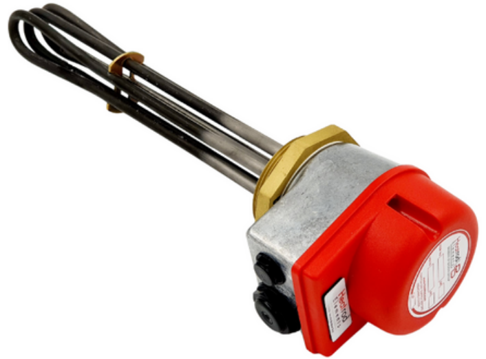
HR Light Industrial Immersion Heater